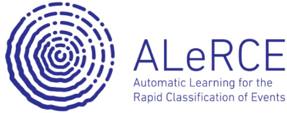
Figure 2. from The Automatic Learning for the Rapid Classification of Events (ALeRCE) Alert Broker null 2021 AJ 161 242 doi:10.3847/1538-3881/abe9bc https://dx.doi.org/10.3847/1538-3881/abe9bc